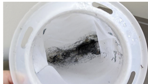
Microfibers shed from washing machines captured in a 100 \mu m filter